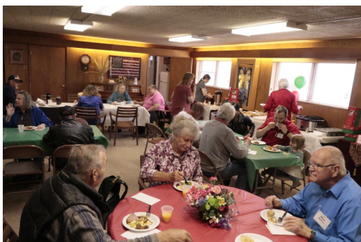
Enjoying the brunch following the presentation.